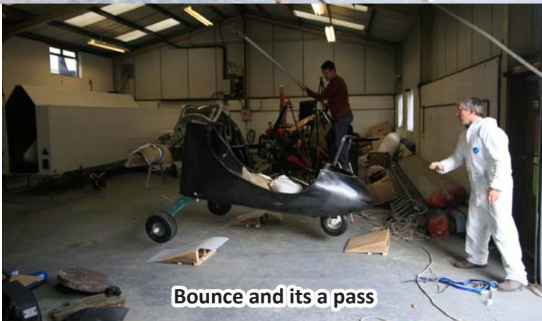
Bounce and its a pass