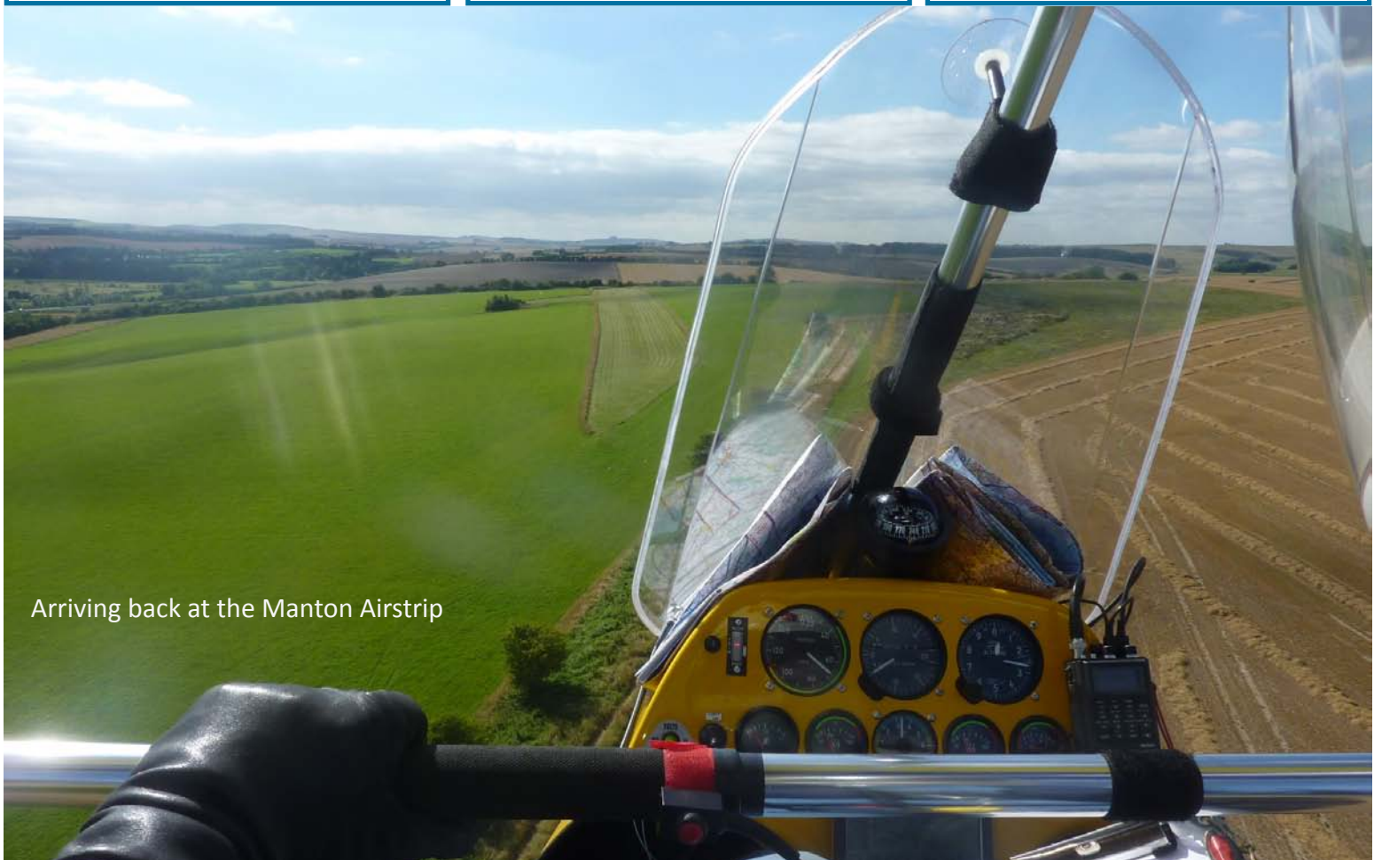
Arriving back at the Manton Airstrip