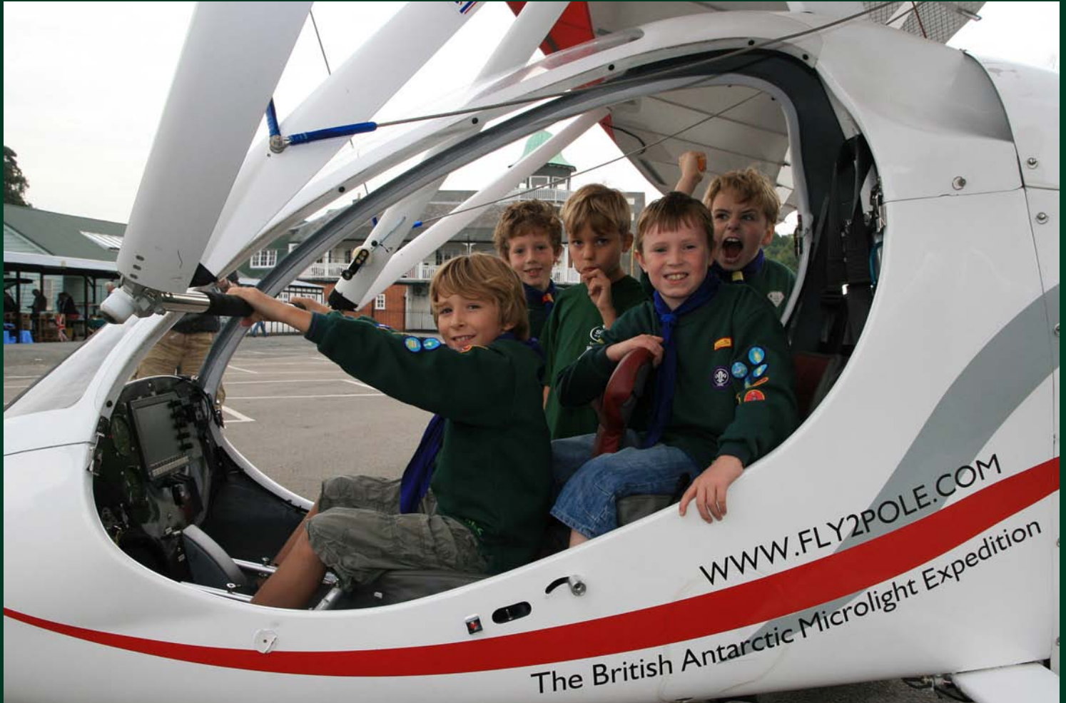
1st Cobham Scout Group

The Museum displays a wide range of motoring and aviation exhibits including the only Concorde with public access in the South East England.