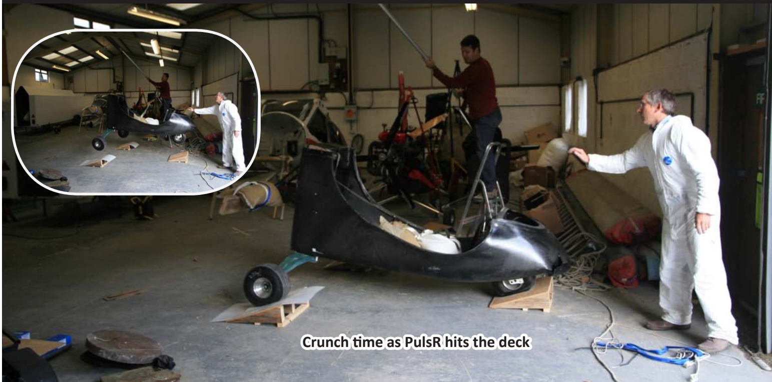
Crunch time as PulsR hits the deck

Its been a long time coming but PulsR is expected to have its BCAR Section S approval by the time of the Flying Show at the end of November. The trike had to go through another drop test in order to satisfy the authorities that the cantilever sprung composite main undercarriage could soak up the roughest of fields. PulsR is the first trike in the world to incorporate a carbon fibre body shell which gives it increased strength and rigidity.