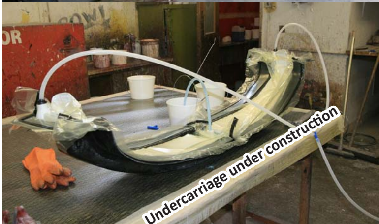
Undercarriage under construction